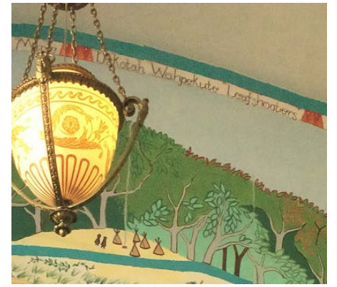
Detail from the Post Office Mural and the Wahpekute recognized in the drawing and banner

Northfield's history started with the original Dakota inhabitants of the area. We are on Dakota land.